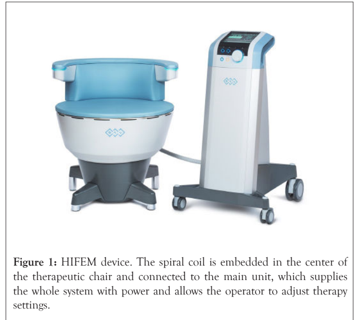
Figure 1: HIFEM device. The spiral coil is embedded in the center of the therapeutic chair and connected to the main unit, which supplies the whole system with power and allows the operator to adjust therapy settings.

to note that the lower the score the better QoL. The obtained results were compared to the baseline and statistically analyzed by a two-tailed paired t-test with the level of significance set as 5%. The Shapiro-Wilks test for normality verified the normality of data.